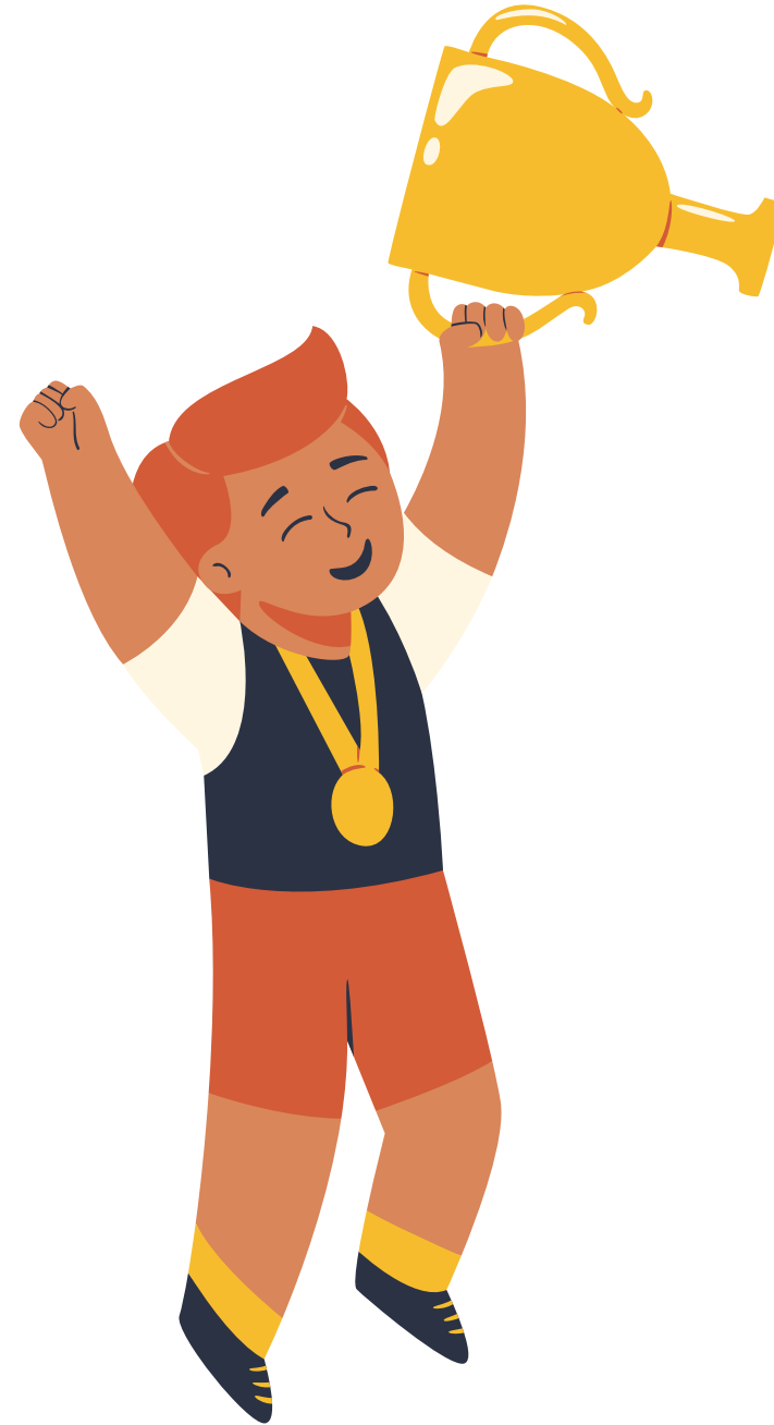
Successful TJ Essay Samples