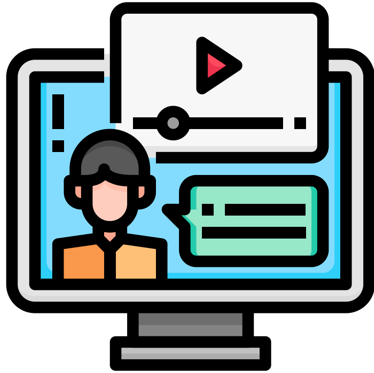
Over 50 videos