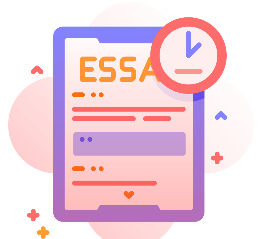
TJ Final Essay Feedback