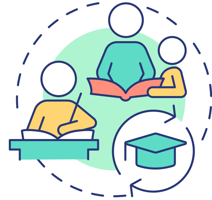
Exam Look-Alike Contents